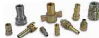
Fittings, Couplings and adapters for all applications