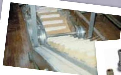
All Belting and conveyor component products