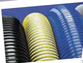
Wood chip/mulch ducting and suction hose.

Whether you need a complete conveyor or replacement parts HCI is here for you. From screw conveyor to belt conveyors. From PT products to pulleys and rollers. Fabricated belting with cleats and lacing for your repair needs.